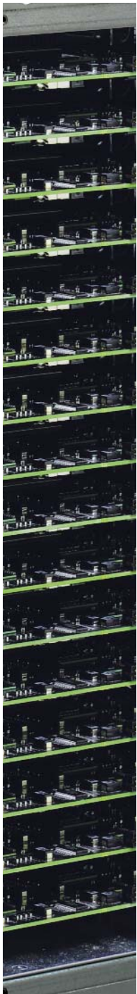
512 Atom cores in a 10 RU SM10000-64

Simplified Operations: All of the 256 Processors in a SeaMicro SM10000-64 can be managed remotely using SeaMicro's redundant management infrastructure. CPU reset and power on/off, installation of new operating system and application software, dynamic modification of load balancer capacity, and system performance monitoring and troubleshooting can be done using a single management API. The management API is built to be integrated into existing operational service systems with minimal effort.